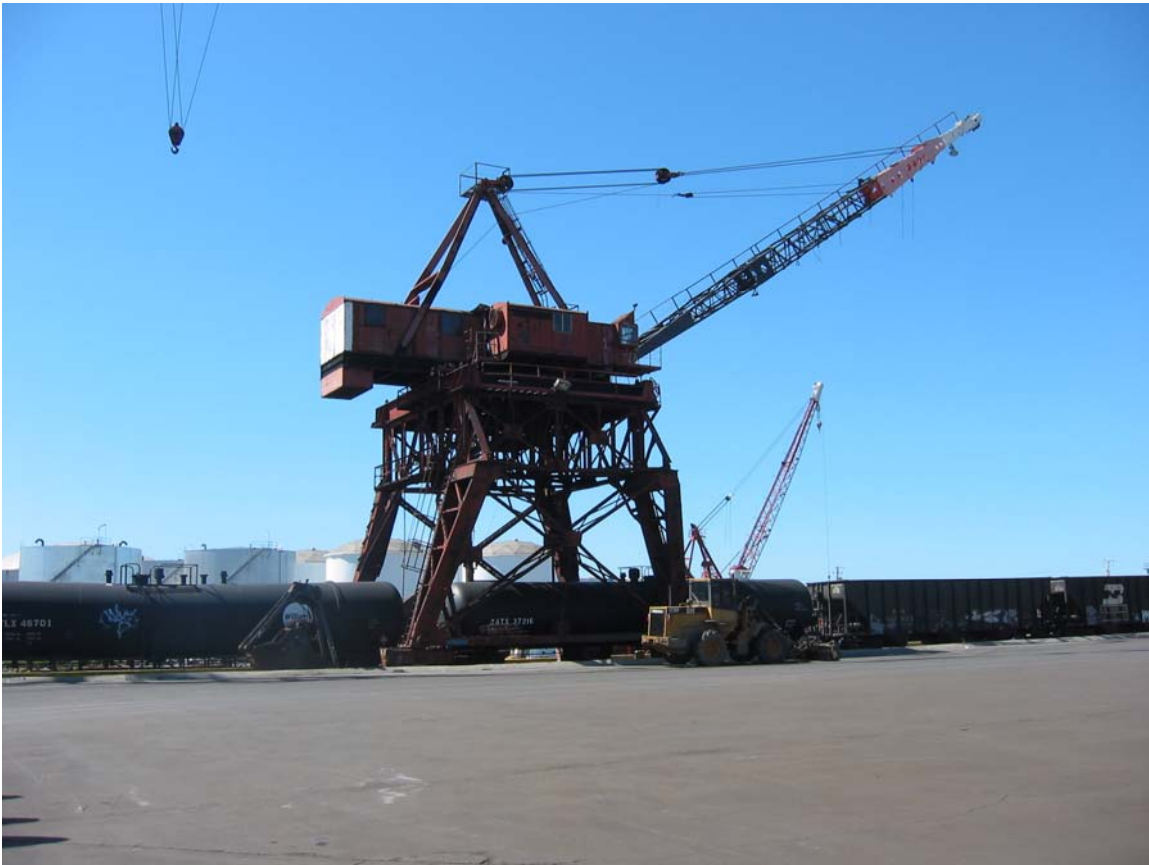
The historic Whirley Crane weighs nearly 500 tons and will be moved via barge and a 500-ton crane from Manson Construction used for bridge construction and retrofit work

Design has been completed for foundation work to enable the historic Whirley Crane currently located at Richmond Levin Terminal to be moved to Shipyard 3 for eventual public viewing. This crane was originally used by Henry Kaiser to build Grand Coulee Dam in 1935 and was moved to the Richmond Kaiser Shipyard No. 1 1941. The crane has been donated by Richmond Levin Terminal, and the relocation is a massive volunteer project.